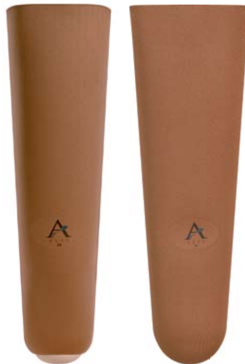
Extreme Locking Liner (AKDT)