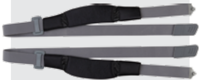
Optional auxiliary straps for the highest level of immobilization