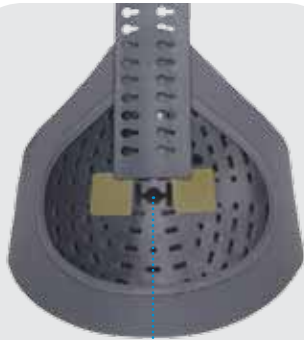
Attachment site with slot secures posterior panels to TLSO belt loop (see below)