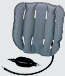
Adjustable air bladder to compensate for post-surgical changes in lordotic curve