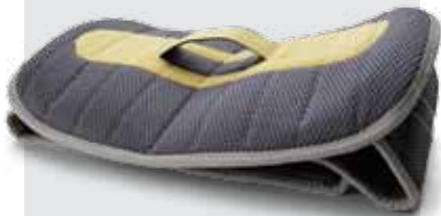
TLSO belt loop fits into attachment slot on posterior panels (see above) for increased stability