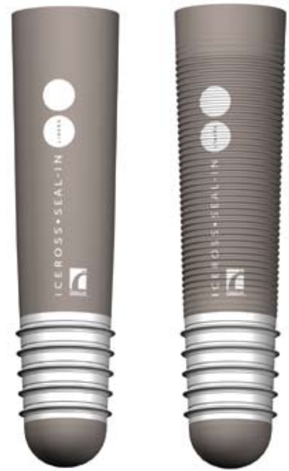
New Iceross Seal-In® X5

Depression of the release button on the socket valve allows quick equalization of air pressure for easy removal of the prosthesis