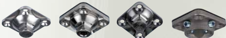
4R54=5 4R74 4R23