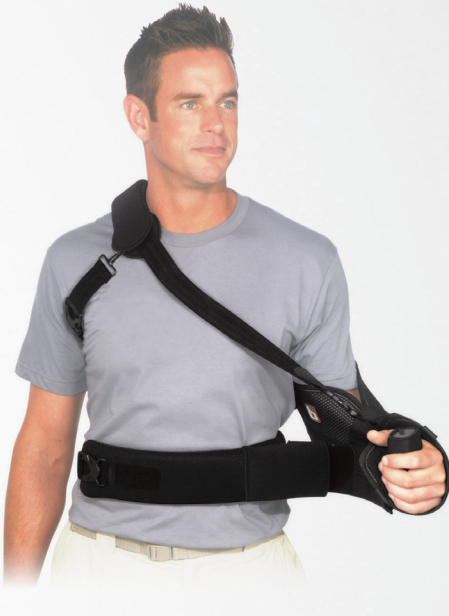
UP TO 70° EXTERNAL ROTATION