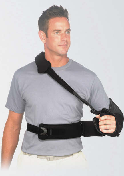
15° – 45° ABDUCTION