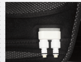
COLD THERAPY CUTOUT