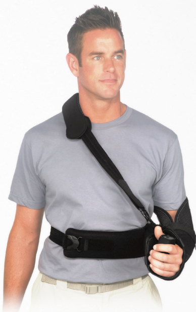
0° TO FULL INTERNAL ROTATION

Post-op requirements vary, therefore the aluminum support can be positioned in a variety of ways including: