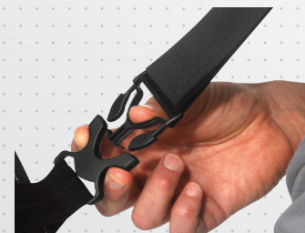
ONE HAND BUCKLE